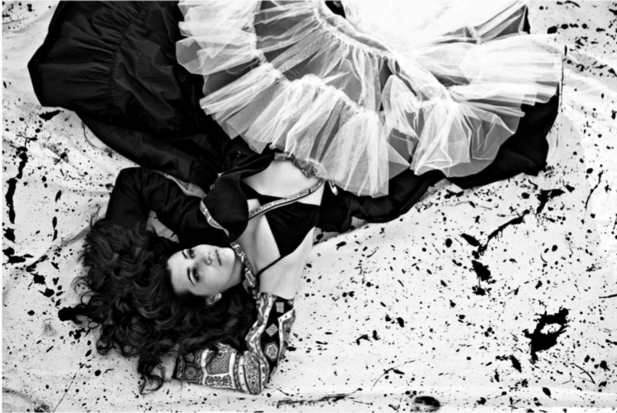
jacket comme des garçons skirt maggie norris bra calvin klein